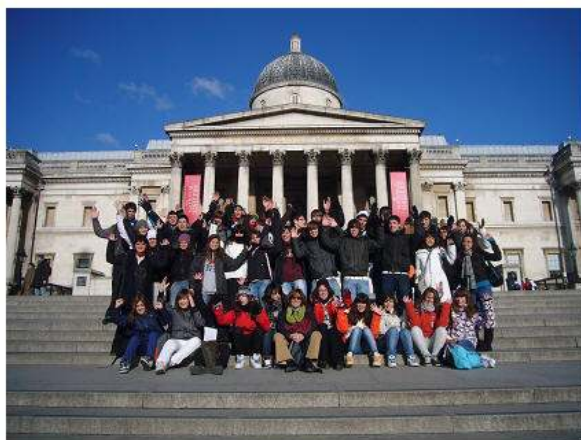
"Thanks, see you next year!" La Mallola School, Barcelona, Feb, 2010